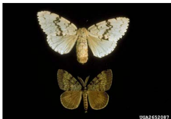
Adult Female (top) and Male (bottom)