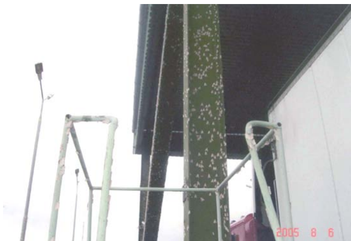
A vessel covered with egg-laying Gypsy Moths in a Russian Port

Knife, paint scraper, or putty knife - to scrape the eggs from the structure.