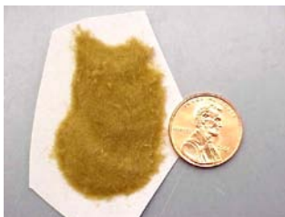
Gypsy Moth egg mass next to penny