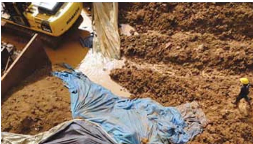
The on-board rectification of cargo moisture levels is far from straightforward.

If cargo is loaded and subsequent concerns arise as to its fitness for safe carriage, there is the obvious problem of identifying within the bulk what parts of the cargo are unfit. Often, therefore, the whole bulk has to be discharged. However, it can be extremely difficult to get cargo re-discharged at the place of loading. This may be because of a lack of facilities to take cargo back: in some remote locations cargo is bulldozed into barges from ashore and whilst cargo can be off-loaded to barges with the ship's cranes, shippers may have a problem getting it back ashore. There may also be complications caused by local customs regulations, which may consider a cargo to be exported once loaded. Quite often, when owners find their ships with unsafe cargo on board, lawyers are instructed and legal battles with charterers and others ensue. The on-board rectification of cargo moisture levels is far from straightforward. Many attempts, using various techniques, have been carried out but with limited success, particularly in holds that are full.