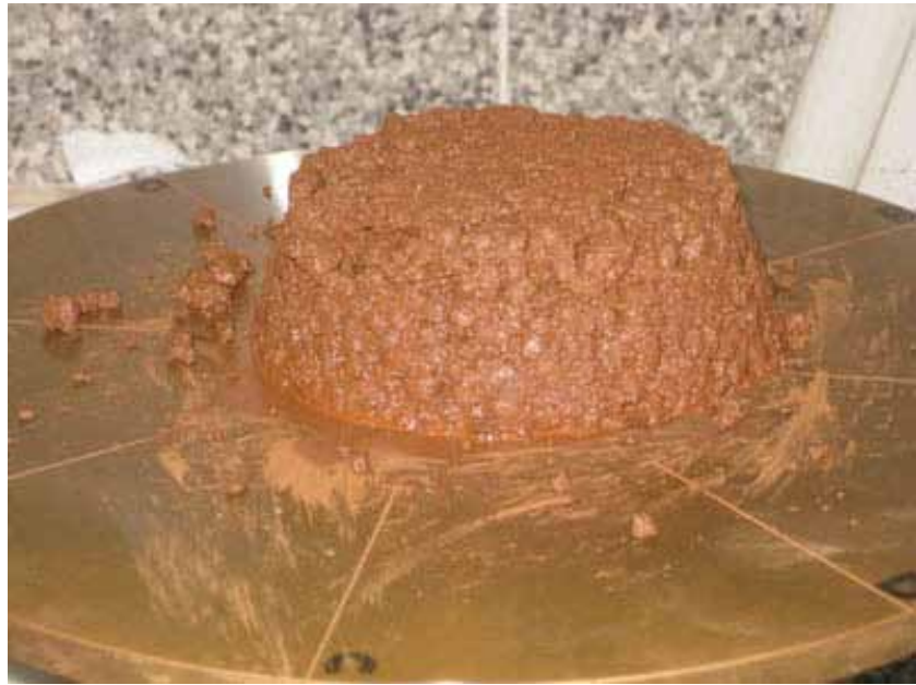
Flow table test.

1) Identification of hazard Prior to start of loading, the shipper must declare to the Master in writing