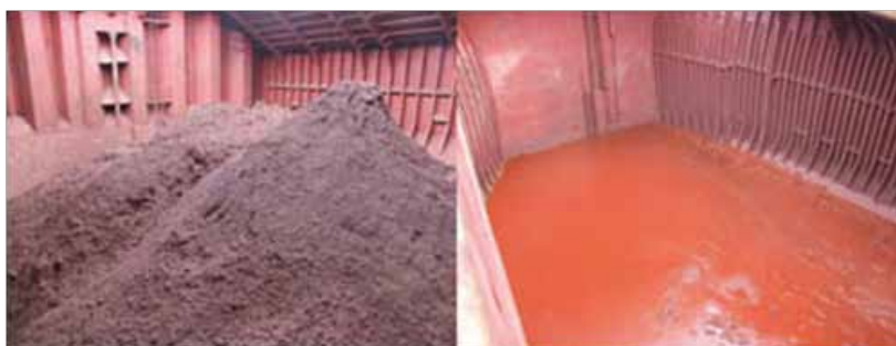
Iron ore fines before and after liquefaction.

In cargoes loaded with a moisture content in excess of the FMP, liquefaction may occur unpredictably at any time during the voyage. Some cargoes have liquefied and caused catastrophic cargo shift almost immediately on departure from the load port, some only after several weeks of apparently uneventful sailing. While the risk of liquefaction is greater during heavy weather, in high seas, and while under full power, there are no