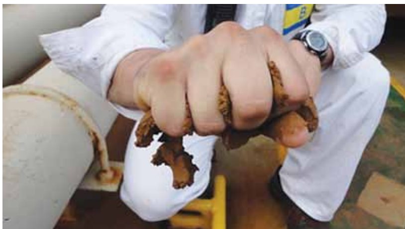
Market forces appear to be driving ships to carry cargoes that may liquefy.

Whilst unreliable shippers' declarations and certificates may be at the heart of the problem, this is complicated by several other problems, some of which are discussed below.